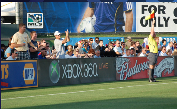
Field Side Reserved